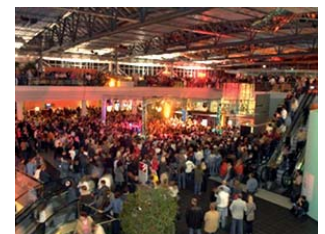
Thousands of guests are expected to attend this year's Airport Night too