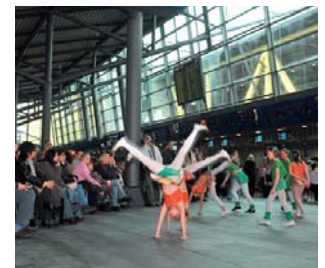
Children were able to enjoy a great programme at the Spain-Portugal Day