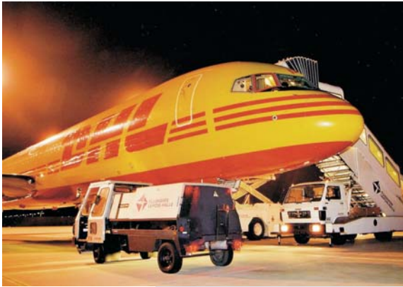
One of DHLs Boeing 757 at the Leipzig/Halle airport

Apart from Antonov AN 26 turboprops, DHL uses Boeing 757 cargo planes. The US-made airfreighters are not only quieter than forerunners but also save fuel. The amount of cargo handled in Leipzig/Halle and forwarded to customers adds up to 50 tonnes per day.