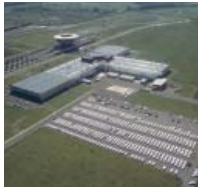
To be extended – the Porsche factory in Leipzig