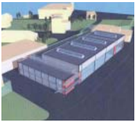
Model of the new helicopter hangar to be dedicated in December

Dresden Airport is adding to its infrastructure. By the end of the year, a new hangar is to be completed which will accommodate three police helicopters and the eurocopter operated by Germany's air rescue service.