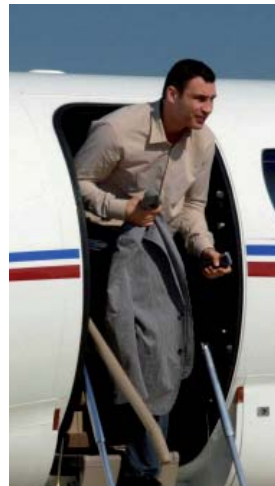
World-class boxer Vitali Klitschko visited Leipzig