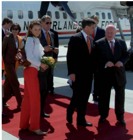
The Netherlands' princely couple Willem-Alexander and Maxima (l.) were received by Prof. Georg Milbradt, Prime Minister of the state of Saxony