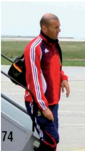
The French team and captain Zinedine Zidane lost to Italy 3 to 5 on penalty shootout

So have been the two airports operating under the roof of the Central German Airports Group. Through the tournament, they have dealt with a rush of supporters and FIFA officials and thus made the World Cup both a sporting and organizational success.