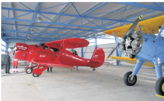
During the airport festival, a Beech Staggerwing and a Boeing Stearman were parked in the new hangar for small planes

Dresden After a construction time of five weeks, a new hangar for small aircraft has been handed over at Dresden airport.