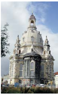
Work to rebuild the Frauenkirche started 1996

Dresden 60 years after the destruction of the Frauenkirche, Dresden celebrated the restoration of the historic landmark.