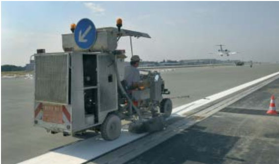
Marking work on the new runway

The job is done. Following one year of construction, the new runway will officially be taken into service on 6 September.