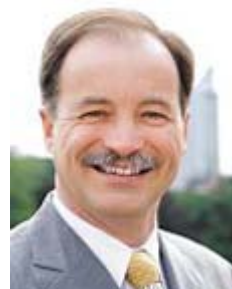
The Saxon Transport Minister Sven Morlok (FDP)

“So far only the section between Thiendorf and Radeburg has been upgraded. The rest of the A 13 motorway in Saxony was given a new road surface after the fall of the Berlin Wall. But as there is not a hard shoulder along the whole route, there is still a speed limit of 130 km/h,” Saxony’s Transport Minister Sven Morlok (FDP) explained. “Even if the building work will cause delays for motorists in the short term, traffic bound for the German capital will be able to flow more safely and faster in future.” The building work is costing about EUR 30 million and will take about three years to complete.