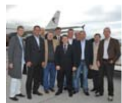
The delegation before leaving LEJ

Foreign trade in Saxony has been growing by double digit rates over the past few years – the Russian Federation was in eleventh position on the list of the most important foreign trading partners for the Free State. In terms of imports, Russia is the second most important trading partner behind the Czech Republic. The Federation will remain a boom market for Central German companies, even after the financial crisis fades away. Some leading business representatives of the Free State travelled to Moscow for a three-day visit on 8 October in order to explore current developments and support Saxon companies in Russia.