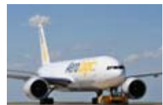
AeroLogic will transport Hermes' import freight in future