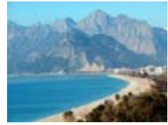
The no. 1 tourist destination: Antalya